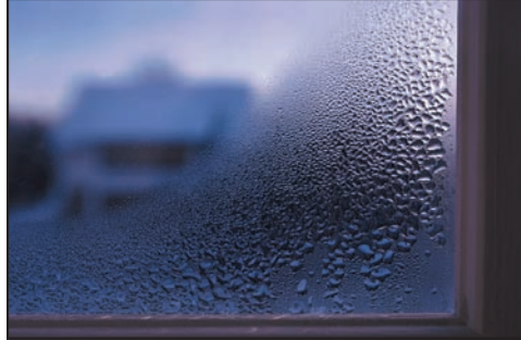
Condensation on the inside of a window-pane.